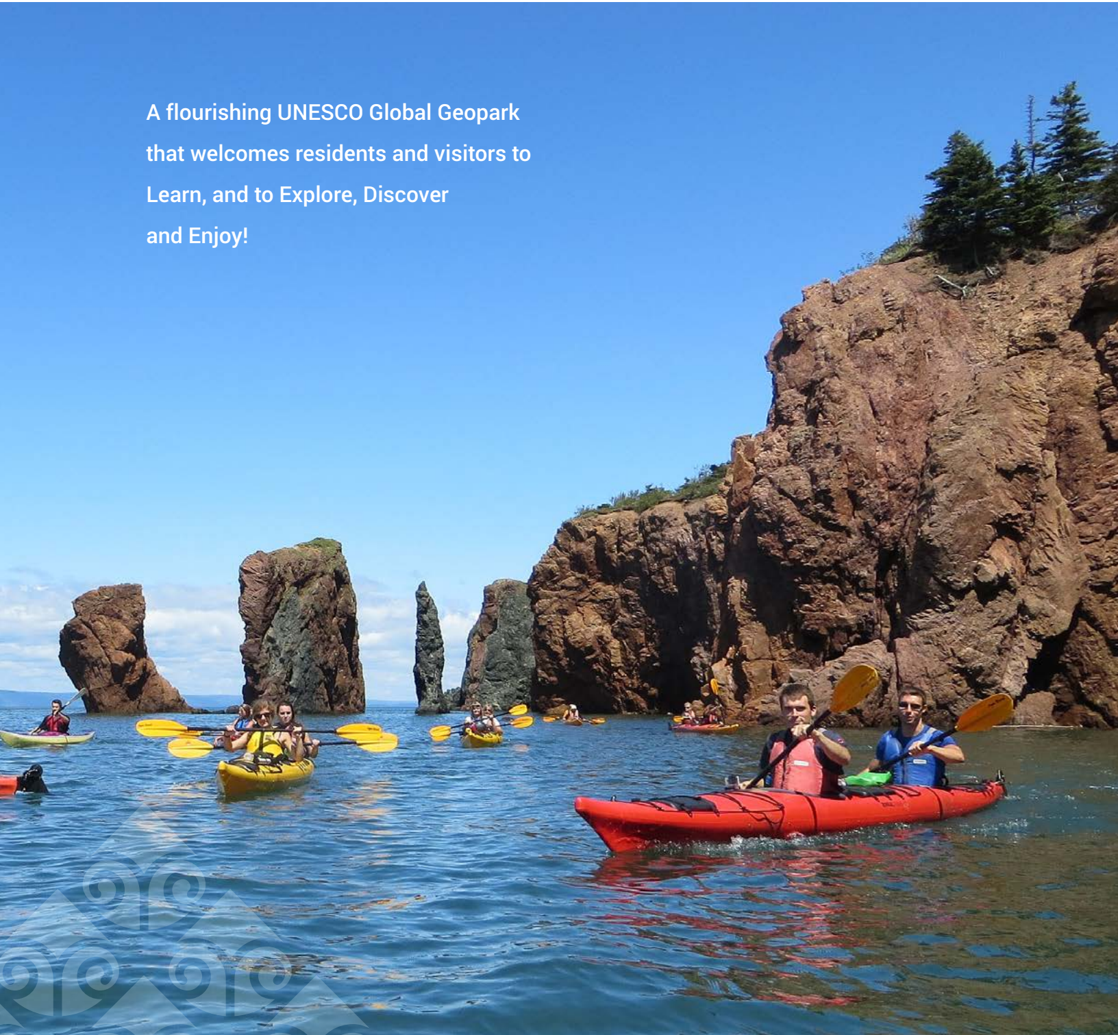
Kayak among the sea stacks at Three Sisters.

A flourishing UNESCO Global Geopark that welcomes residents and visitors to Learn, and to Explore, Discover and Enjoy!