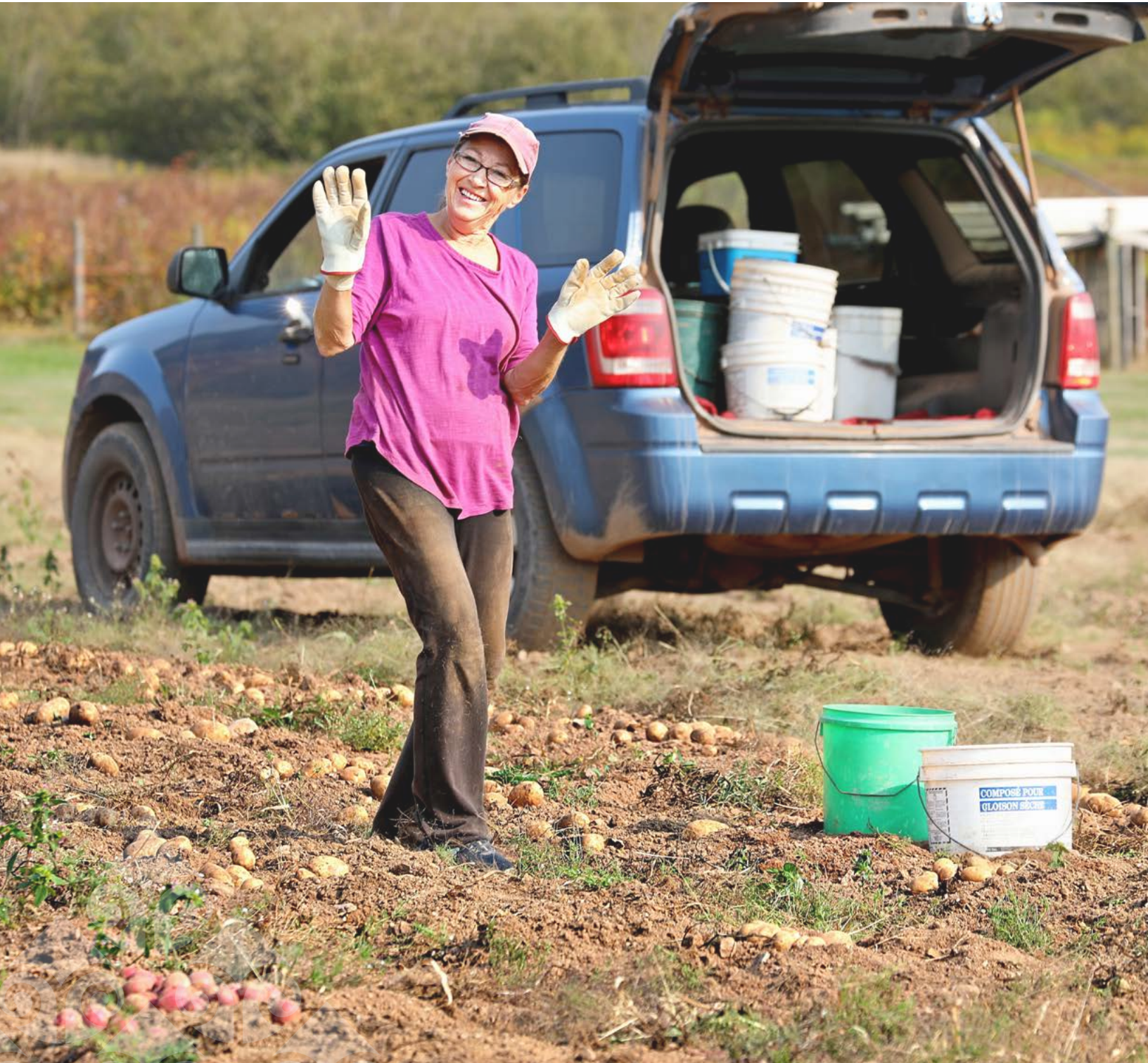
Harvesting potatoes at the homestead farm in Fox River.

(utilizing our re-validation directives as a guideline)