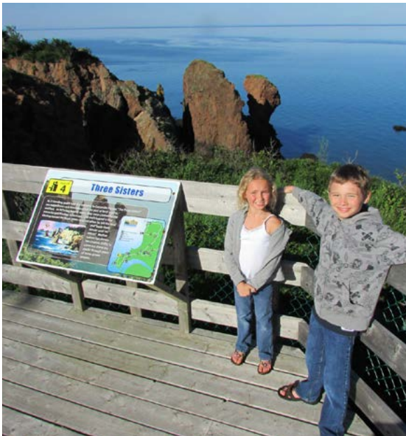
Residents and visitors of all ages can enjoy our trails and lookoffs.