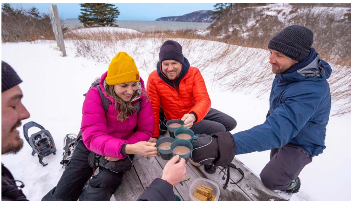
Healthy outdoor activities can be enjoyed year-round in the Geopark.