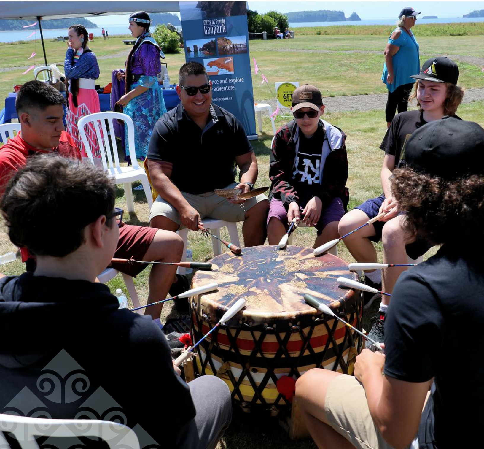
The Iron Tide drummers, singers and dancers helped us celebrate at our official designation as a UNESCO Global Geopark.