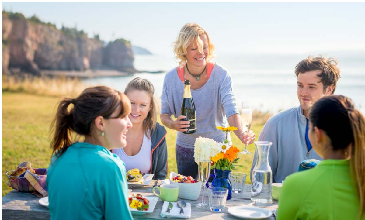
Enjoying GEOfood outdoors with friends.

Reference : Global Geopark Network / UNESCO Geoparks GGN / ( visitgeoparks.org )