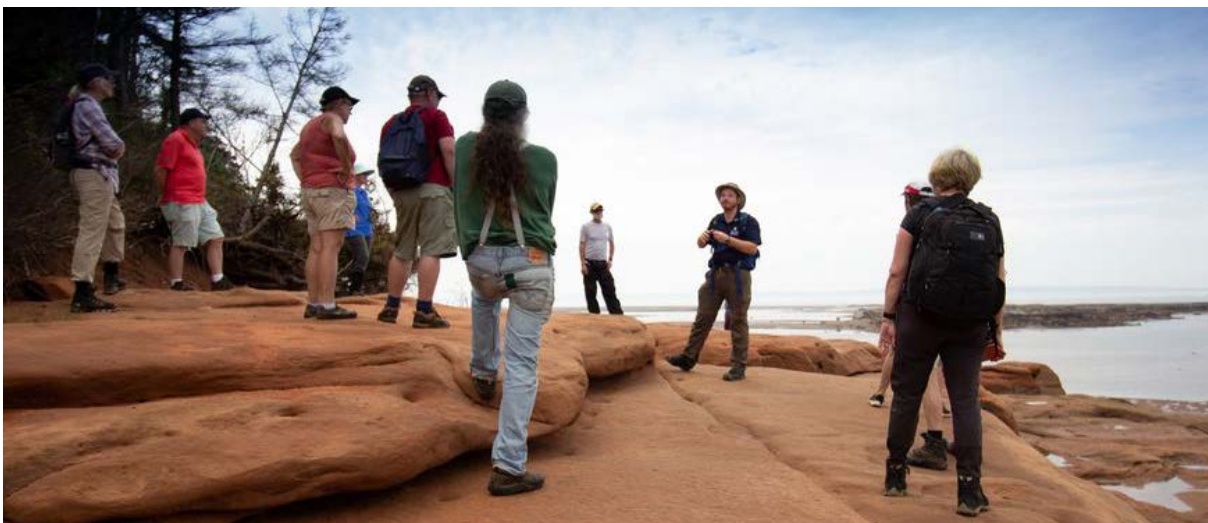
Our geoscientist leads a variety of tours each year in the Geopark.